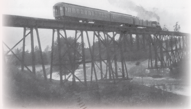
Above: A postcard from around 1900 shows a passenger train crossing the Mill Creek Trestle.