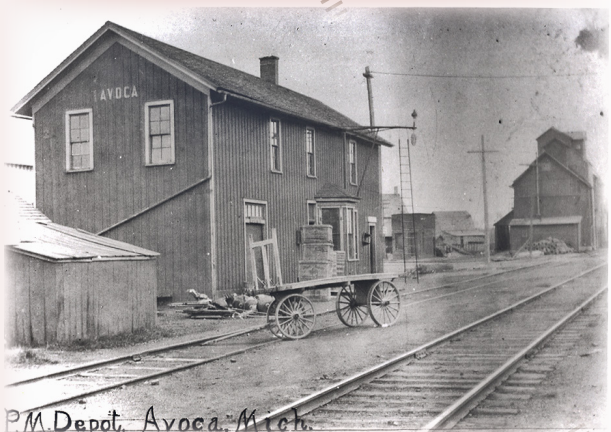
P.M. Depot, Avoca, Mich.